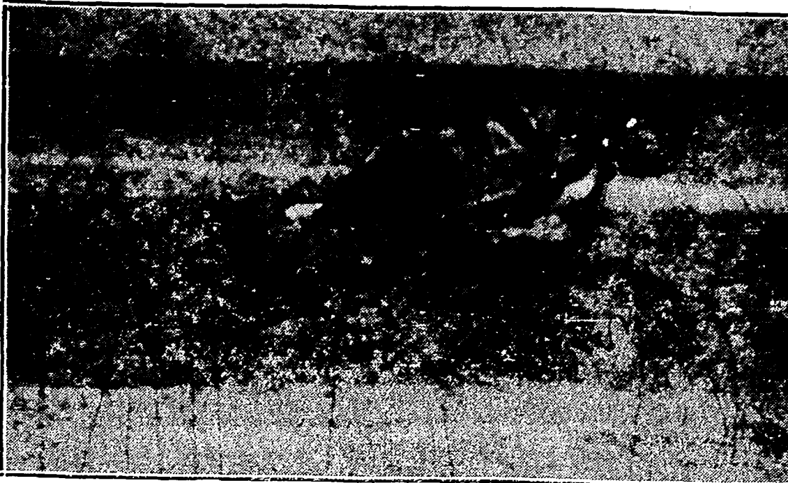
This striking picture shows a racing car driven at tremendous speed by Tommy Newton, as it skidded at a perilous angle round a curve in a recent race at Burbank, Cal. Newton made this dangerous curve in similar fashion fifteen times during the race without accident.