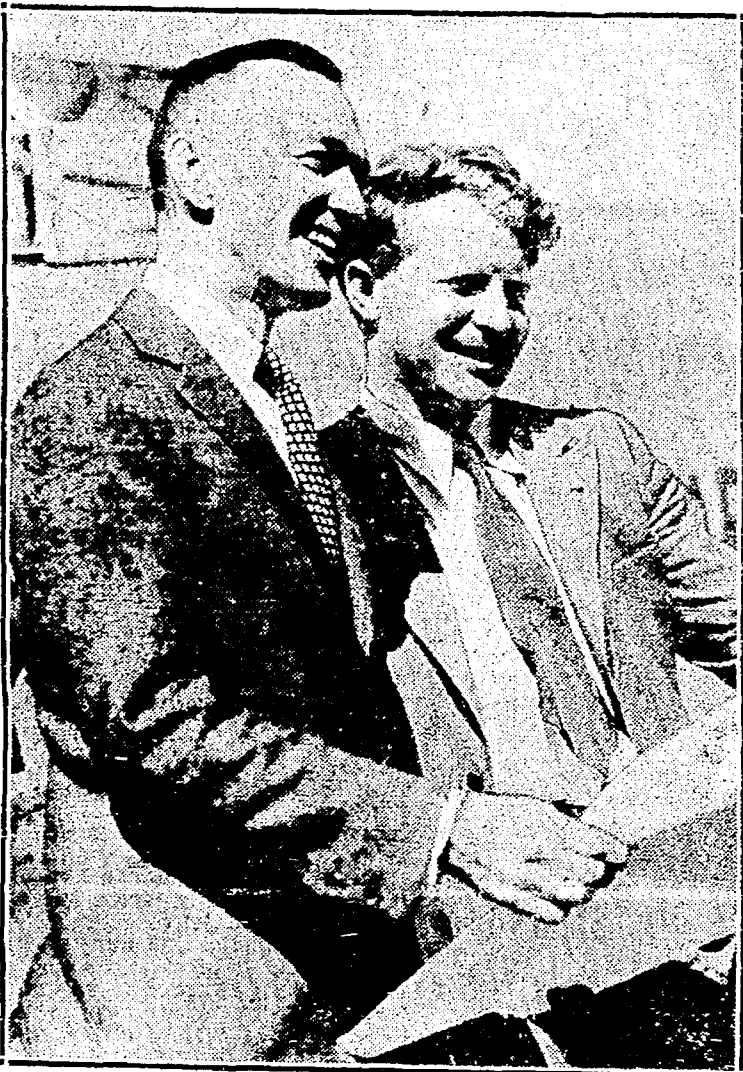
Lincoln Ellsworth, noted Arctic explorer, and Bernt Balchen, the well-known flier, who are planning an expedition into the Antarctic regions next year in a specially designed plane, are pictured at the airport at Inglewood, Cal., where they recently met to inspect their new plane.