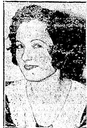
Betty Compton, well-known musical-comedy actress, is pictured as she arrived in New York City on her return from a trip to Europe. Interviewed on her arrival, she stated that a famous check for $7,500 which she had received indirectly from ex-Mayor James J. Walker of New York had been in payment of a bet, but she did not reveal its nature.