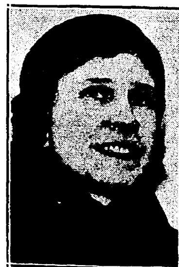
The Countess Margit Bethlen, above, wife of the former premier of Hungary, Count Stephen Bethlen, had only just arrived in this country when she received the news of an assassin's attempt to knife her husband in Budapest. She is pictured shortly after her arrival in New York.