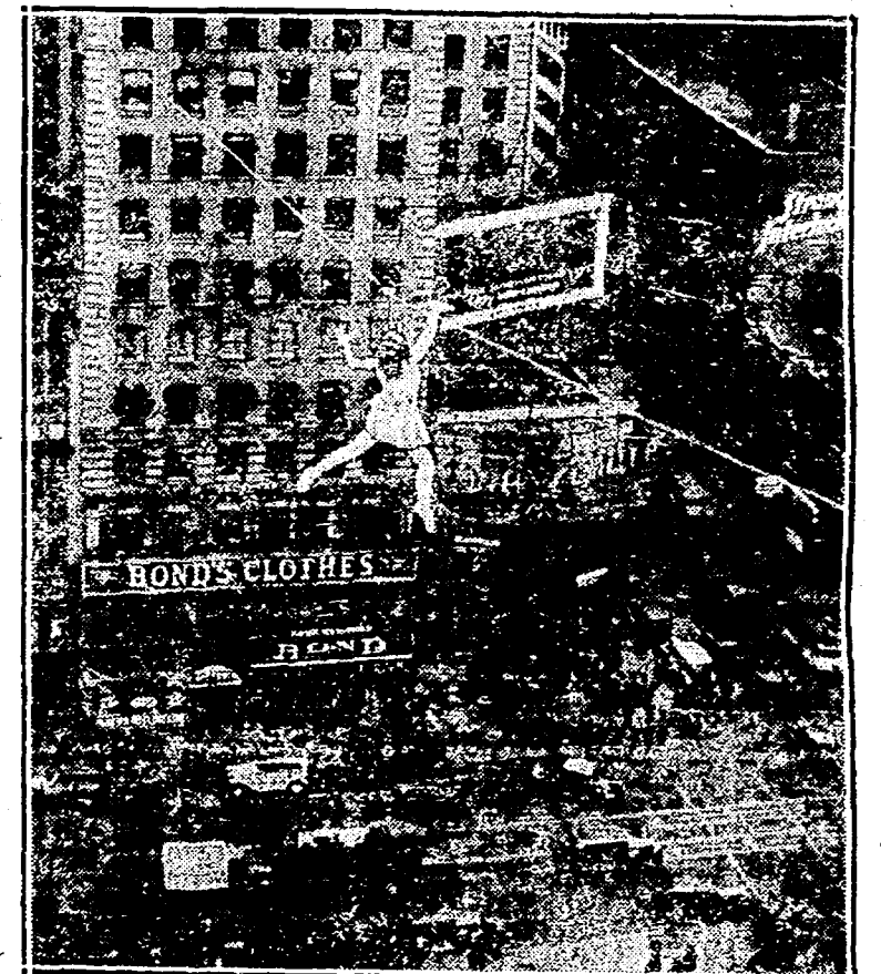
Advertising her act at a vaudeville theater in New York City, Tiny Kline, girl daredevil, is seen above as she slid by her teeth down a cable stretched 1,134 feet across Broadway at a height of 600 feet. After successfully accomplishing her stunt, she was placed under arrest for violating a city law.