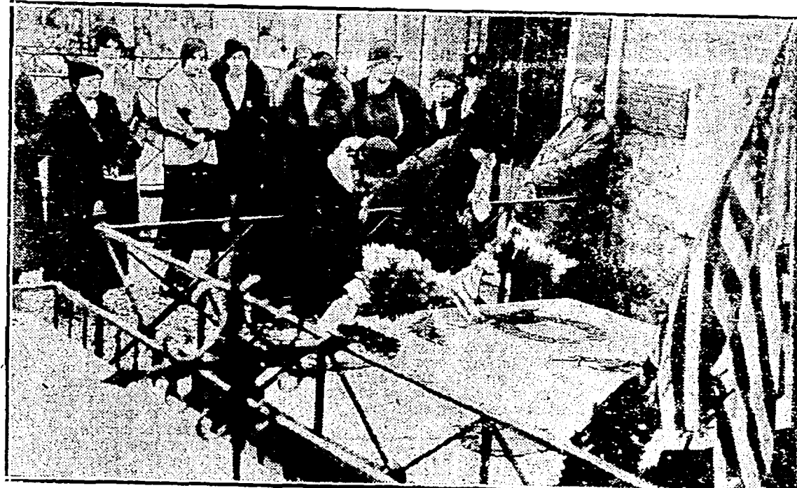
Members of the Daughters of the American Revolution are seen in Paris as they laid wreaths on the tomb of General Lafayette. The delegation went abroad to place a tablet in Fehring Hall in memory of the French soldiers who gave their lives for the American cause in the Battle of Yorktown.